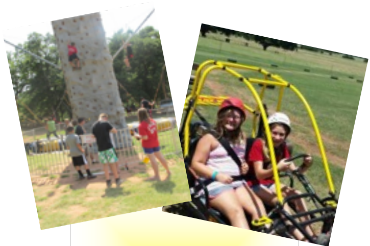
Climbing Wall with 2 Jumper Stations, Swimming Pool, Repelling, Go Carts, Slip N' Slide, Human Foosball, Low Ropes Courses, King Swing, Volleyball, Hiking, and much more!!!